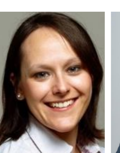
Evelyn Stempel Federal Office of Public Health